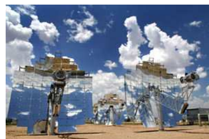
Figure 1.2. Stirling dish engine. These beautiful concentrators deliver a power per unit land area of 14 W/m 2 .