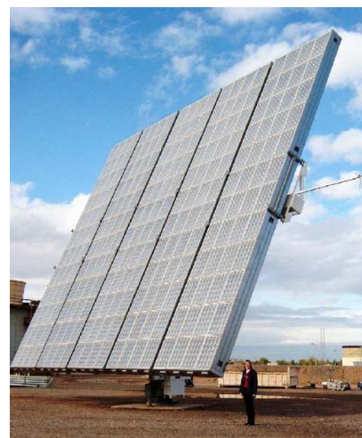
Figure 1.1. A 25 kW (peak) concentrator photovoltaic collector produced by Californian company Amonix. Its 225 m 2 aperture contains 5760 Fresnel lenses with optical concentration \times 260 , each of which illuminates a 25%-efficient silicon cell. One such collector, in an appropriate desert location, generates 138 kWh per day – enough to cover the energy consumption of half an American. Note the human providing a scale.

Figure 1.3 shows two yellow squares, each 600 km by 600 km. The one overlapping Texas shows the area within North America that, completely filled with concentrating solar power, would provide everyone there (500 million people) with an average power of 250 kWh/d (today's average consumption). The one in Africa, completely filled with concentrating solar