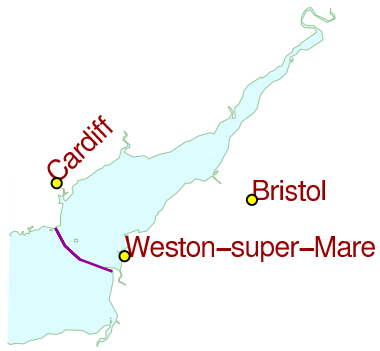
Figure 1. The proposed Severn barrage on the same map as the existing 750 m-long barrage at la Rance, 3 km from Saint-Malo.